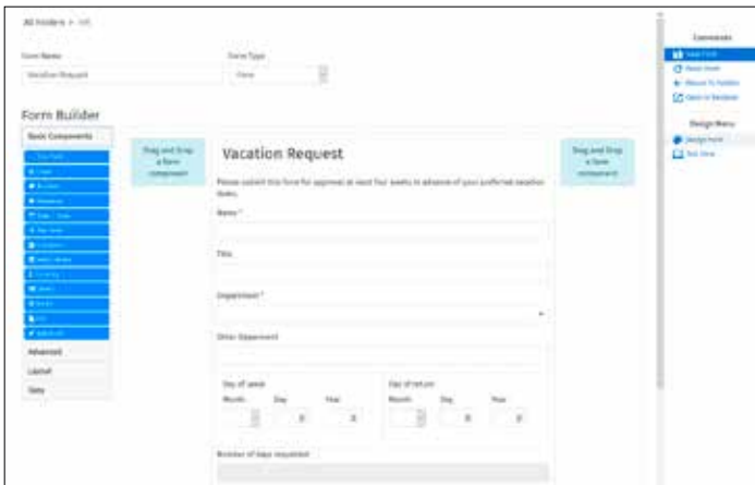
Designing a form in the Therefore™ Forms Designer

Many industries rely heavily on data collection from clients or potential customers, including: