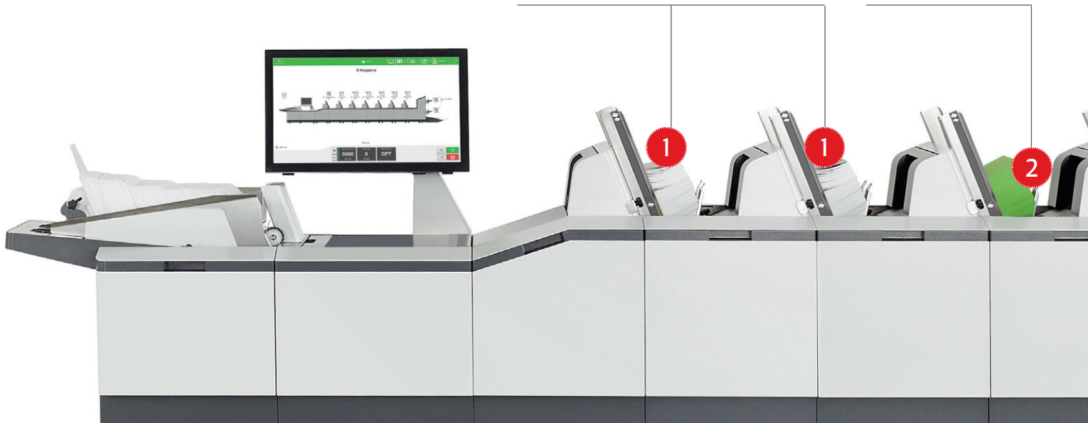
2. Loading on the fly helps to increase productivity