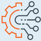
Robotic Process Automation