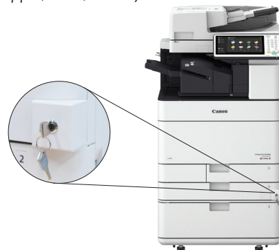
Shown: imageRUNNER ADVANCE C5500i series

Locking paper cassettes are also available for the imageCLASS MF525dw, MF515dw.