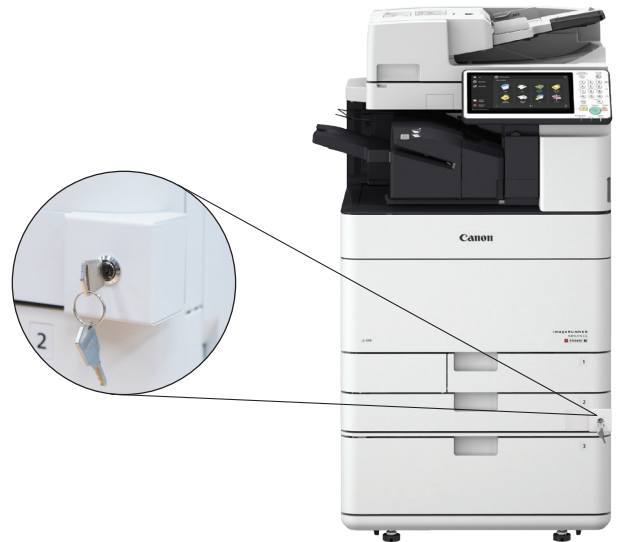
Shown: imageRUNNER ADVANCE C5500i Series

imageRUNNER ADVANCE 8500i/8500i II Series