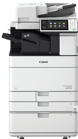
imageRUNNER ADVANCE C5500i Series Shown

With potential risks everywhere, both external and internal, organizations want tools to help protect their data. The innovative features and easy-to-use functions of the third generation imageRUNNER ADVANCE Series can help reduce the risk of information leaks and enhance overall security with multilayered security solutions to help safeguard sensitive data.*